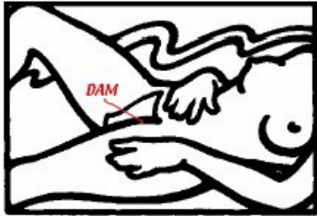
Dam placement for oral/vaginal sex